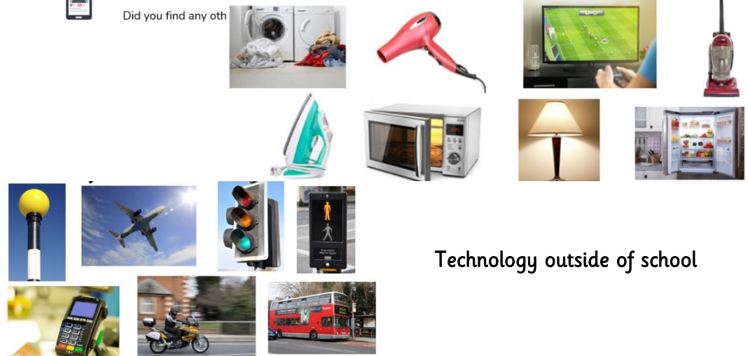
Technology outside of school