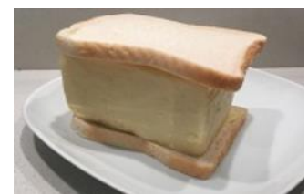
Step 9) Add an eye

Debug - To find and remove errors from computer hardware or software.