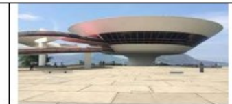
Niteroi Art Museum