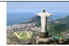
Christ the Redeemer