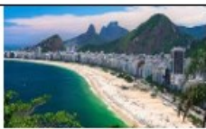
Copa Cabana Beach