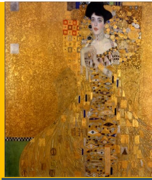
Portrait Of Adele